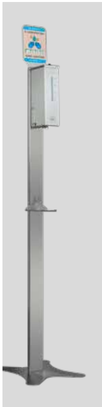
YIBTECH FSR 1000 A