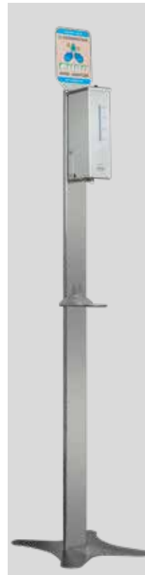
YIBTECH FK 1000 A